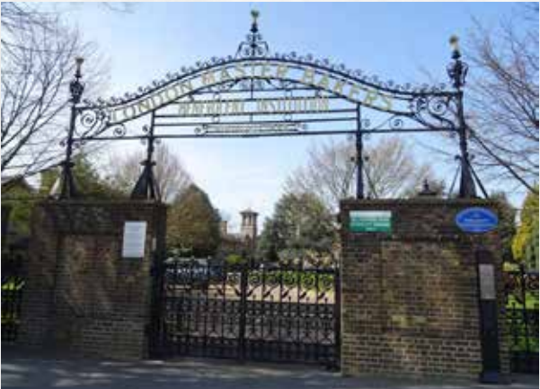
Bakers Alms House