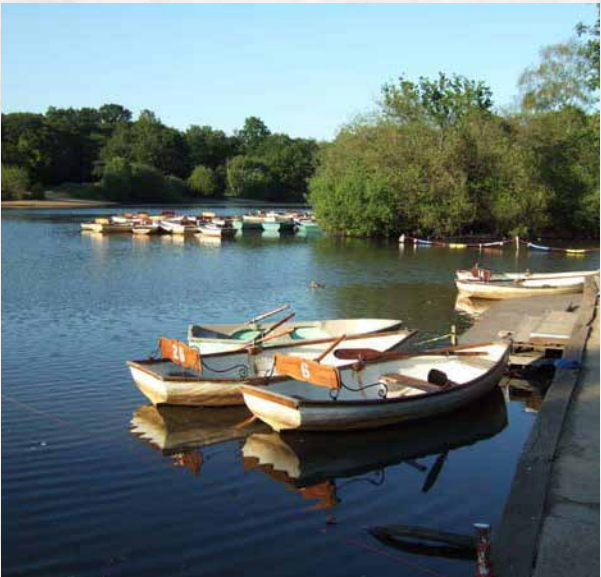
Hollow Ponds, Leytonstone