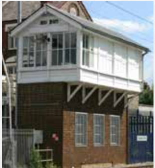
■ Higham Park Signal Box

Once you've had a look at where Sir George was born you can have a look around the shops and places to eat on Hale End Road or head to Highams Park station via the Avenue for services to Liverpool Street, Walthamstow and Chingford.