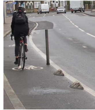
Example of a semi segregated cycle lane