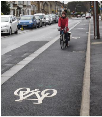
Example of a fully segregated cycle track